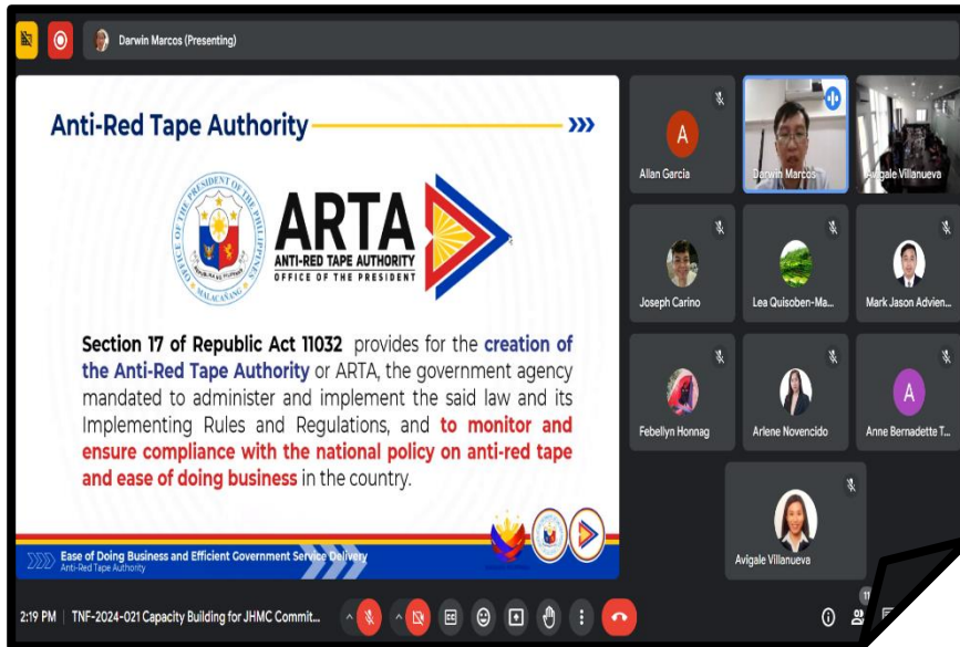
Capacity Building for JHMC Committee on Anti - Red Tape 16 April 2024 Anti - Red Tape Authority