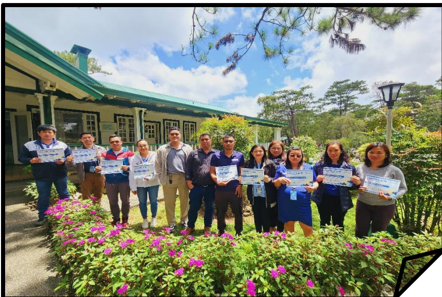
Environmental Management System: Industrial Hygiene 28 May 2024 Alfa Personnel Care Language Tutorial Inc. Bell House, Camp John Hay, Baguio City