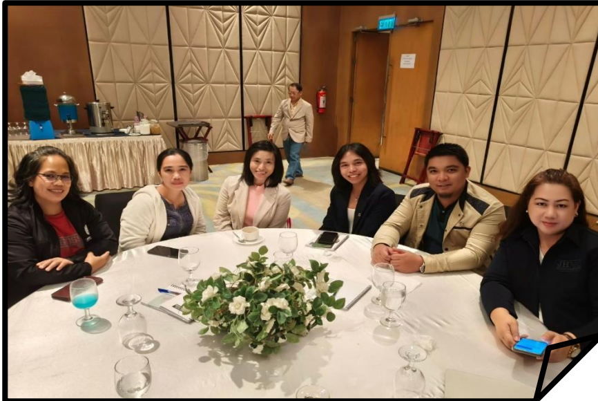
SEC Small and Medium Industries and Large Enterprises Embracing Sustainability (SEC SMILEES) 18 September 2024 Securities and Exchange Commission Ion Hotel, Baguio City