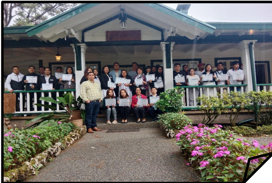
Quality Management System: Quality Workplace Standards 27 May 2024 Alfa Personnel Care Language Tutorial Inc. Bell House, Camp John Hay, Baguio City