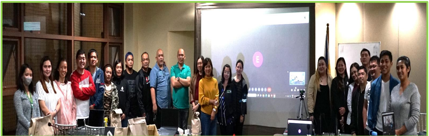
The physical Attendees of the Operations Planning Activity on the 2 nd day.