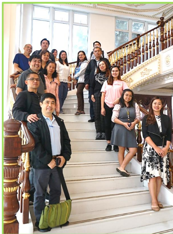
The Participants of the Q1 Performance Review held on 27 April 2023.