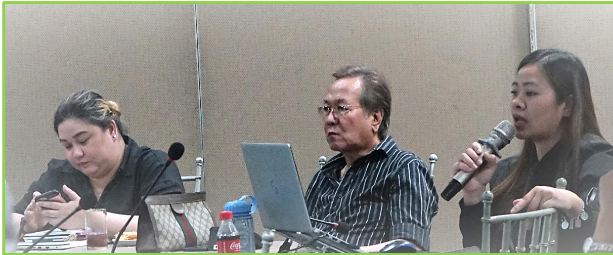
The President and CEO and Vice-President and COO physically joining the Operations Planning Activity.

This activity completed the Strategy Formulation Phase and as a result, the JHMC Strategic Plan 2024-2028 was approved by the BOD during the 07 July 2023 Meeting.