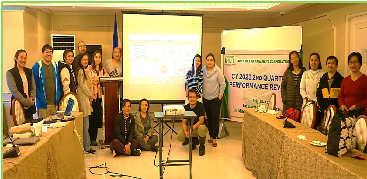
Despite the work suspension due to the effects of the inclement weather named Typhoon Egay (Doksuri), 81% of the Participants attended the Q2 Performance Review held on 28 July 2023.