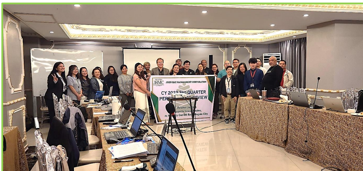
The Participants of the Q3 Performance Review held on 19 October 2023.