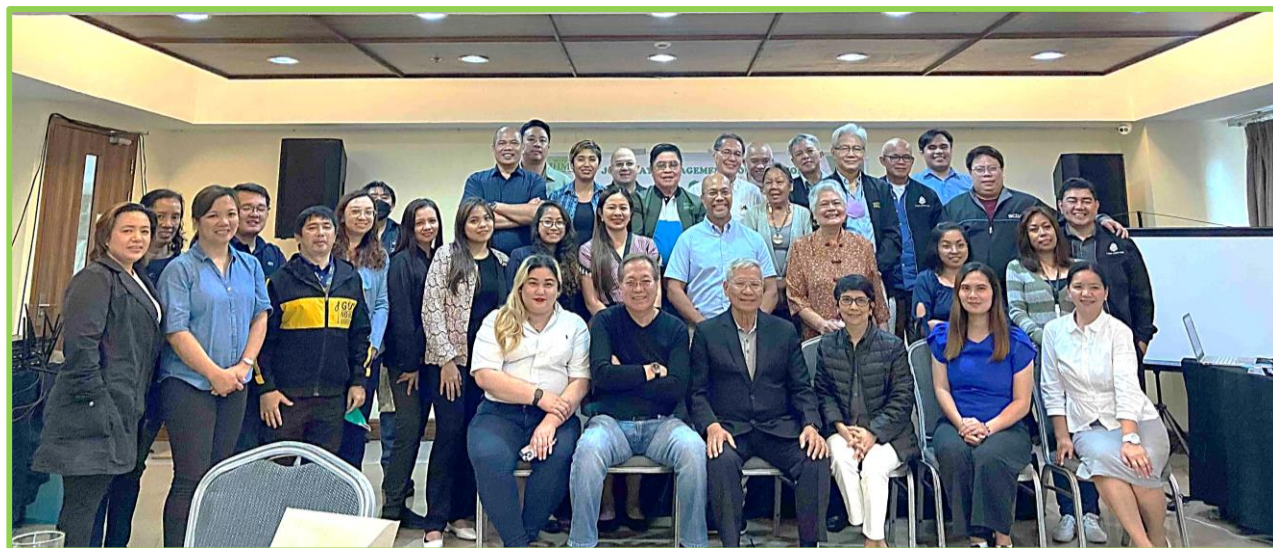
The Participants with the JHMC BODs and BCDA Planning Services Department.