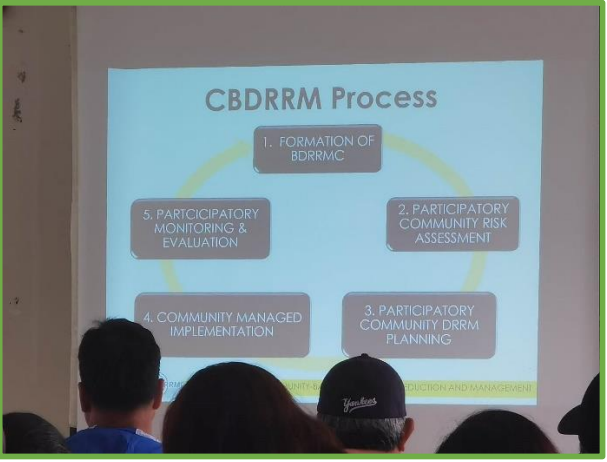
Representatives from the Barangays Within JHRA attended the 3-day Training and Workshop held on 12-15 April 2023, initiated by the JHMC.