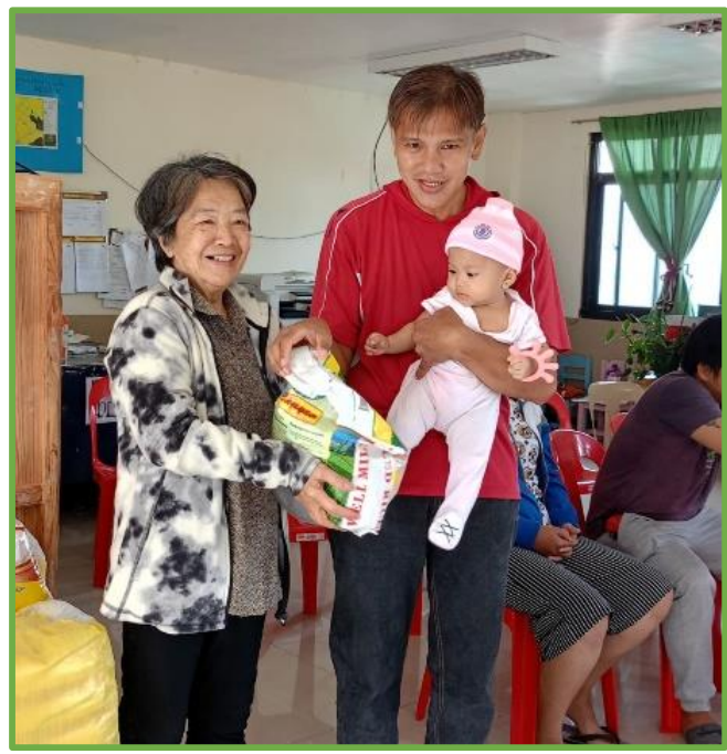
Actual distribution conducted on 15 September 2023 to identified Greenwater Constituents based on the List provided by the Barangay.