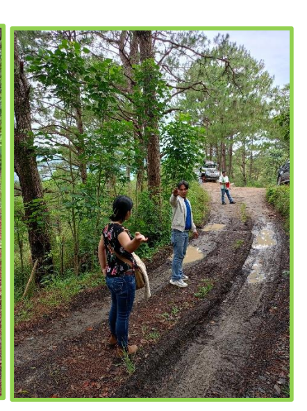
JHMC Foresters, together with the Barangay Representative, during the validation and assessment conducted on 27 June 2023 at the Communal Forest of Barangay Daclan, Tublay, Benguet.