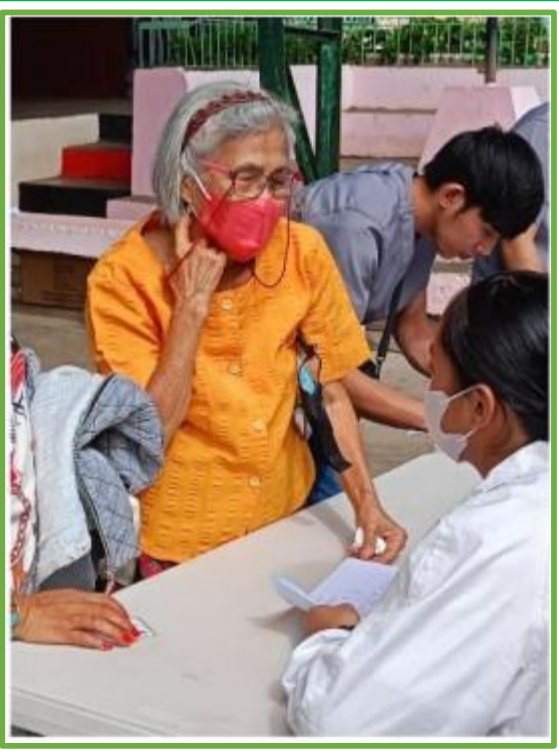
Elderly Week Celebration as part of the Community Health Development Program held on 06 October 2023 at San Vicente Elementary School, Camp 8, Baguio City.