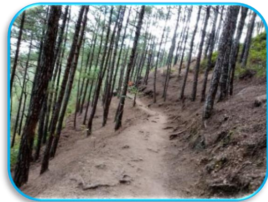
Firelines at the Yellow Trail