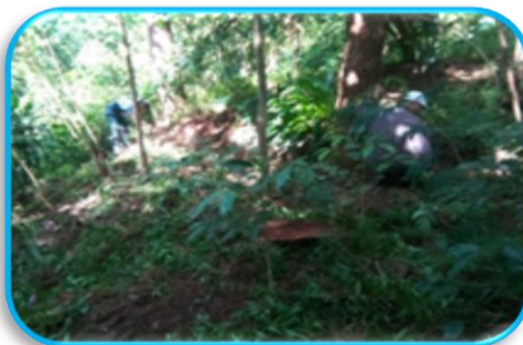
Gathering of Wildlings