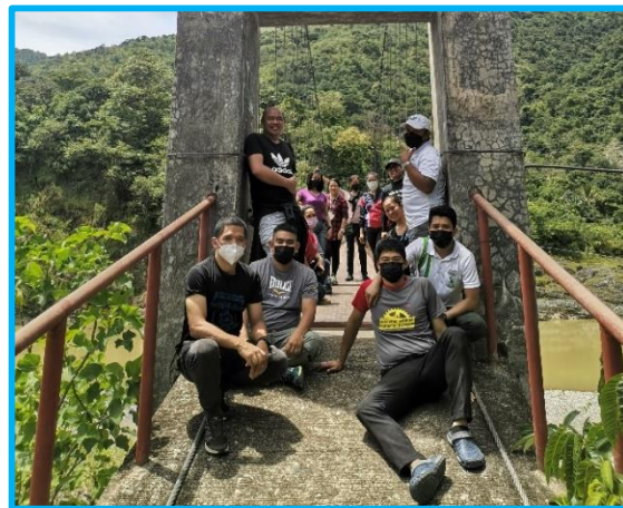
Reforestation Activity in Tinongdan, Itogon, Benguet on June 25, 2022