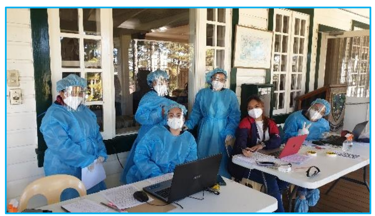
JHMC Volunteers during the ACT-Baguio City on February 03, 2021 held at the Bell House, Historical Core, Camp John Hay.