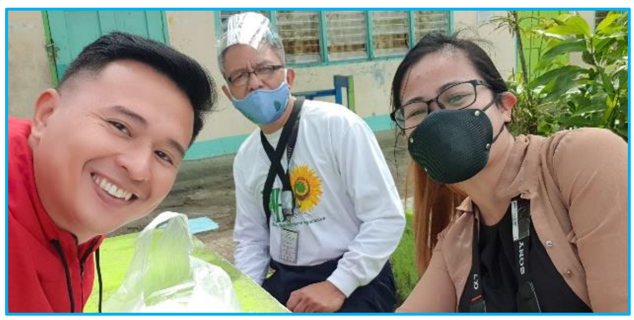
JHMC Volunteers during the Aggressive Community Testing (ACT) held in Kalinga Province on February 19-20, 2021.