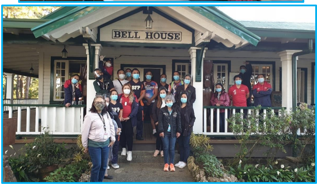
JHMC Volunteers during the ACT-Baguio City on February 03, 2021 held at the Bell House, Historical Core, Camp John Hay.