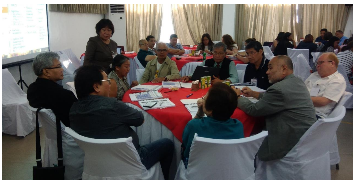
CY 2018 Joint Board of Directors and Management Strategic Planning conducted in April 2018 at Bauang, La Union.