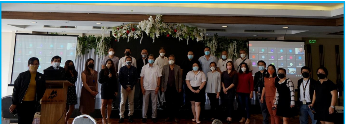
The JHMC BODs, Management, and Staff and BCDA – Corporate Planning Department