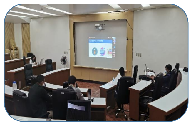
53 of 62 CY 2020 PRESIDENT'S REPORT