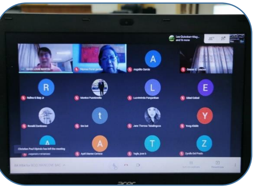
52 of 62 CY 2020 PRESIDENT'S REPORT