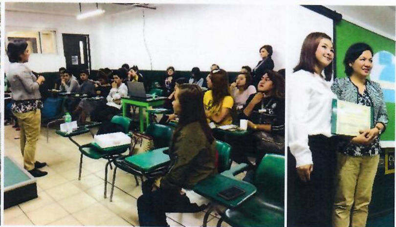
JHMC-Environment Officer giving awareness talk on "Business and Climate Change Adaptation" to the BS Administration students of University of the Cordilleras on 10 July 2019.