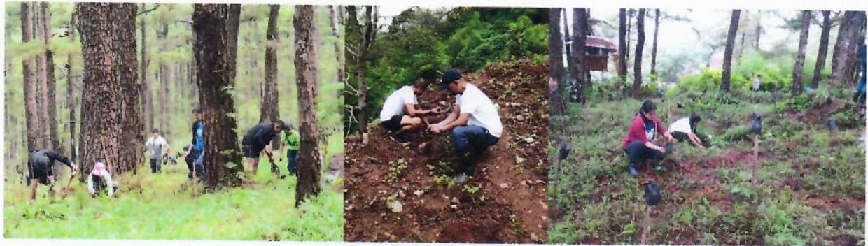
Volunteers planting trees during the celebration of the Arbor Day on 25 June 2019.