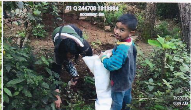
Tree planting with San Vicente National High School and other volunteers on 27 July 2019.