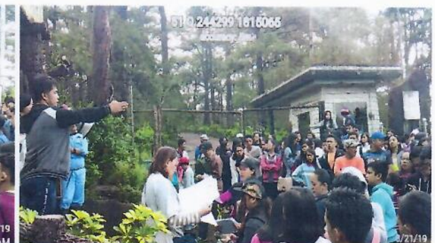
Orientation before the Tree planting and ecological awareness drive with DepEd Baguio Division Schools on 21 August 2019.