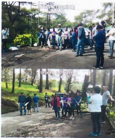
Earth Month Celebration Plogging and Mini Eco-Talk