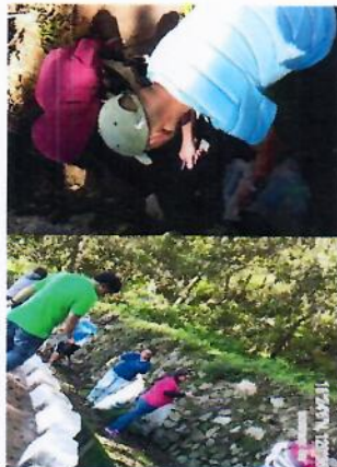
Participation of JHMC in EMB-CAR's Cordillera-wide Campaign: "Bayani ng Kalikasan" on 19 June 2019