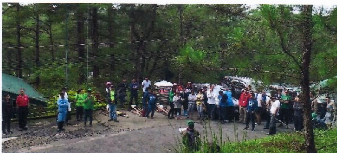
Orientation to all Volunteers on 25 June 2019 before the tree planting activity in participation for the celebration of the Arbor Day.

JHMC organized and conducted seven (7) Eco-Awareness talks with a total of 591 participants from different public and private schools, JHSEZ locators, various government agencies and private organizations. It aims to increase awareness as well as to encourage active participation in the protection and conservation of the environment and natural resources.