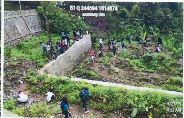
Tree planting and ecological awareness drive with DepEd Baguio Division Schools on 21 August 2019.