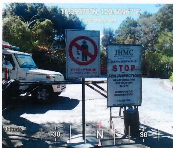
Signage in the strategic entry points within the JHSEZ that have information signage on the Anti-Littering Policy.

JHMC also established the Anti-Littering Policy within the JHSEZ. Signages in the strategic entry points within the JHSEZ have information signages on the Anti-Littering Policy enforced in the JHSEZ.