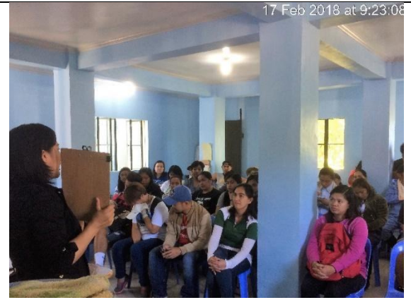
JHMC orientation of volunteers and participants at the Barangay Loakan Liwanag Hall.

The Adopt-an-Estero program is a collaborative undertaking among the communities, private entities, local government units and the DENR. Under the program, partners and organizations "adopt" a portion of a waterway to improve its water quality through regular clean-up drives, conduct information and education campaigns in surrounding communities, and mobilize the citizenry in helping clean up the waterway. JHMC continually participated in the program. For 2018, a total of 1.441 tons of solid wastes were collected from the clean-up conducted at the Loakan Creek.