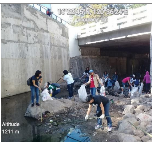
18 of 28 CY 2018 PRESIDENT'S REPORT