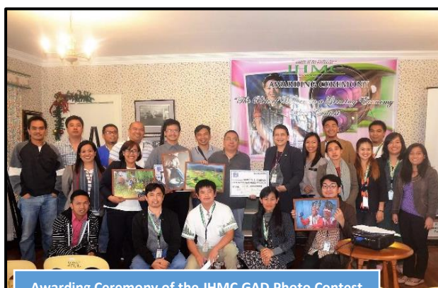
Awarding Ceremony of the JHMC GAD Photo Contest at the Bell House, December 2016

In July 2016, a GAD-Photo Contest with the theme: “The Role of Women in a Growing Economy” was sponsored by JHMC. There were 32 entries submitted and the awarding ceremony was done in December 2016.