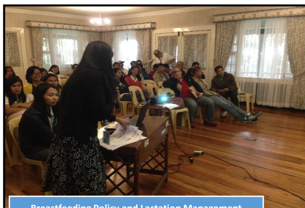
Breastfeeding Policy and Lactation Management Orientation, September 2016

The JHMC continues to be compliant with Republic Act 10028 on the establishment of its Lactation Station. In 2016, the JHMC Board approved the “Policy on Breastfeeding Promotion in the Workplace” . The Lactation Station was transferred to Cottage 628 of the JHMC Office Complex and is made available for all nursing employees, stakeholders and visitors of Camp John Hay. It is due for accreditation with the Department of Health for the “Working Mother-Baby Friendly Certificate” in 2017.