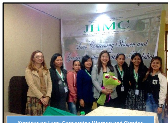
Seminar on Laws Concerning Women and Gender Sensitivity Training Workshop, November 2016

In July 2016, a GAD-Photo Contest with the theme: “The Role of Women in a Growing Economy” was sponsored by JHMC. There were 32 entries submitted and the awarding ceremony was done in December 2016.