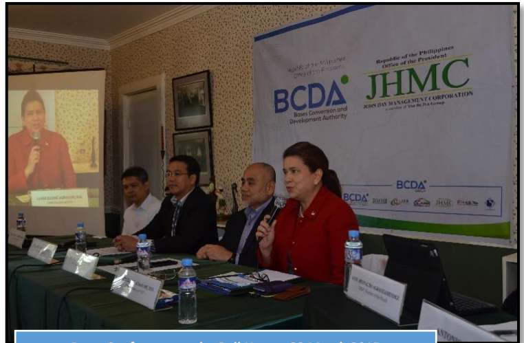
Press Conference at the Bell House, 23 March 2015

Three “ Kapighans ” with the local press were likewise conducted in 2015, and one in 2016, to apprise them on the efforts of the government relative to the legal cases against the CJH Devco, and the protection of the interests of the general public who may have been affected by the aforesaid cases.