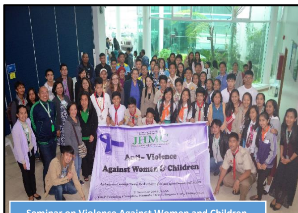
Seminar on Violence Against Women and Children, October 2016

The JHMC conducted Awareness Seminars on Violence Against Women and Children, and Anti-Sexual Harassment and Gender Sensitivity with the assistance of the Civil Service Commission (CSC). The participants included JHMC personnel, student leaders and teachers from the Baguio City High School, barangay officials from the JHRA and the JHSEZ locators.