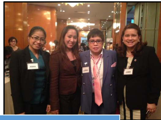
Women Empowerment and Leadership Seminars, 2014 and 2015