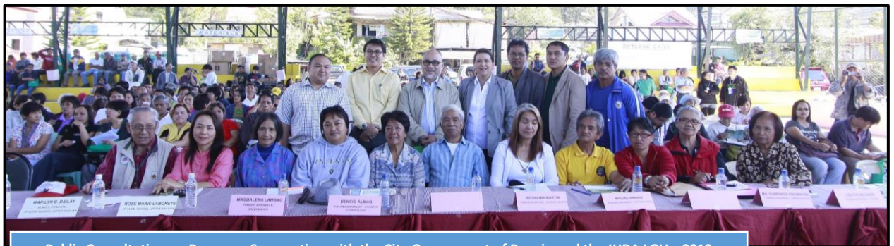
Public Consultation on Barangay Segregation with the City Government of Baguio and the JHRA LGUs, 2013

In May 2016, the BCDA Board of Directors approved the draft Executive Order (EO) submitted by the JHMC for the segregation of Barangay Hillside from the CJHR, which include the issuance of residential lot awards to the bona fide residents. The draft EO was subsequently submitted to the Office of the President for final approval.