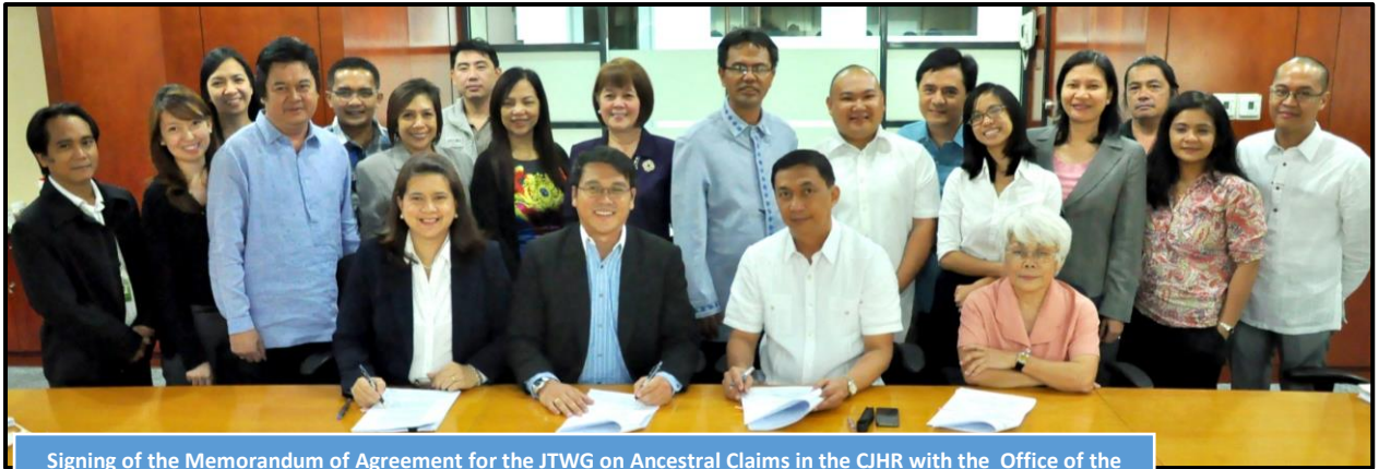
Signing of the Memorandum of Agreement for the JTWG on Ancestral Claims in the CJHR with the Office of the President, NCIP, BCDA and JHMC, 2012

The findings of the IATF were compared with the data obtained from the research work of the JHMC's LAMD in 2014 and the results of the 2013 Joint Technical Working Group (JTWG) on Ancestral Land Claims (with the OP, NCIP, BCDA-JHMC). This revealed an additional 13 Certificates of Ancestral Land Titles (CALTs) issued by the NCIP involving 32,457 hectares. This resulted to a total of 48 CALTs and one (1) Certificate of Ancestral Domain Title (CADT) covering 217.5 hectares found overlapping with BCDA land.